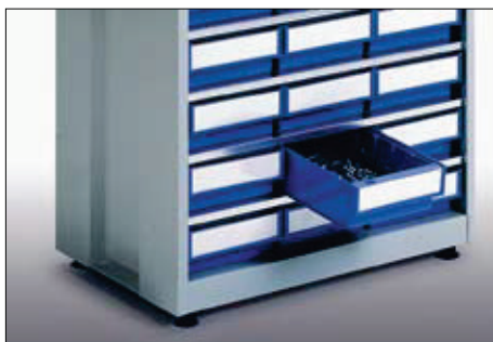
Profiled sides and welded assembly give the frame strength and rigidity