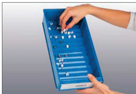
Corrugated base eases the picking of very small items