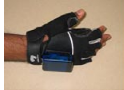
Figure E. Reader-embedded glove

to interpret such data, RFID readers must be able to communicate with a database or other computer program.