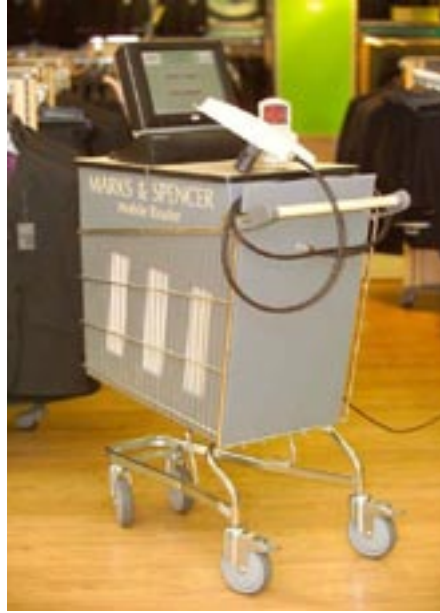
Figure D. Mobile reader