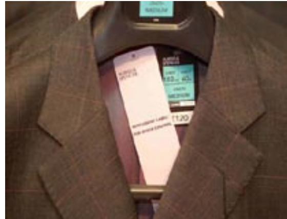
Figure B. RFID hang-tag