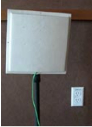
Figure C. Stationary reader